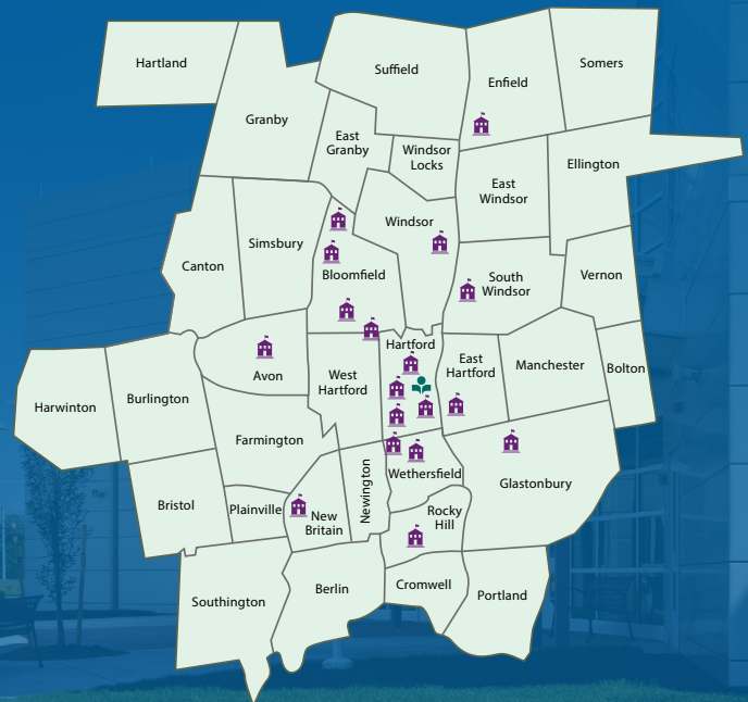
■ CREC Member District 🏠 CREC Magnet Schools